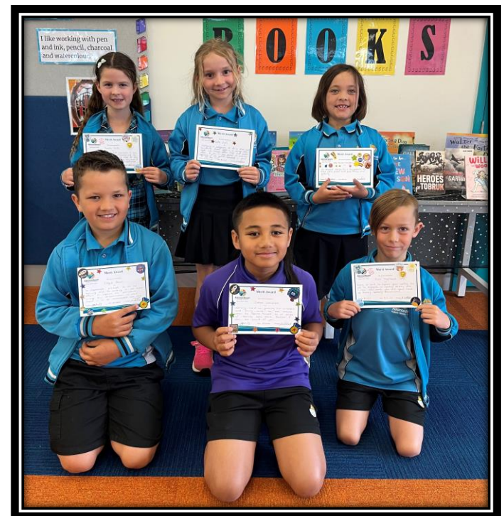
YEAR 2 MERIT AWARDS