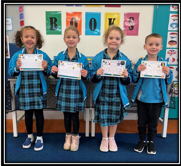
PRE-PRIMARY MERIT AWARDS