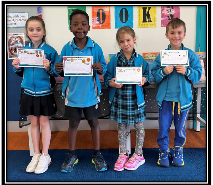
YEAR 1 MERIT AWARDS