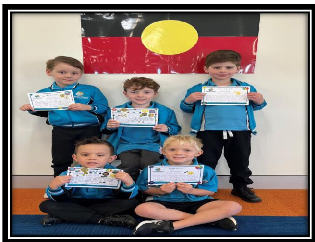
PRE-PRIMARY MERIT AWARDS