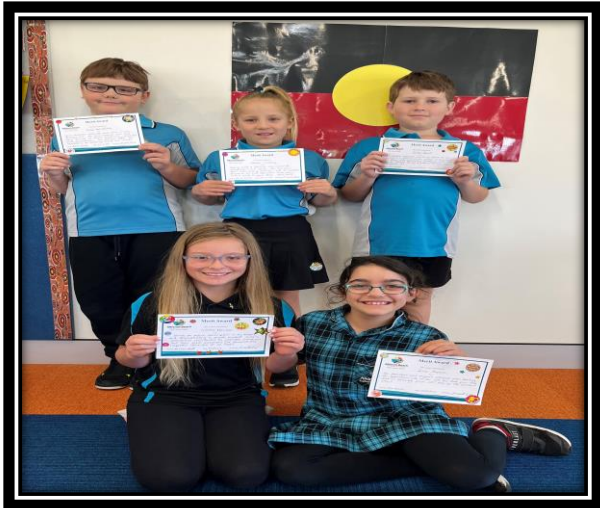
YEAR 4 MERIT AWARDS