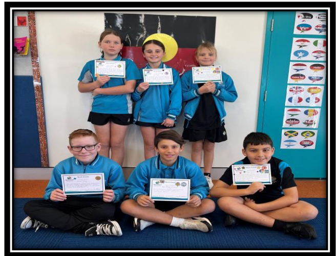
YEAR 5 MERIT AWARDS