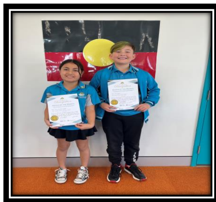
AUSSIE OF THE MONTH