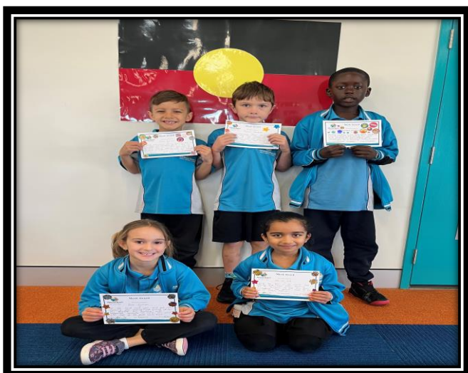
YEAR 2 MERIT AWARDS