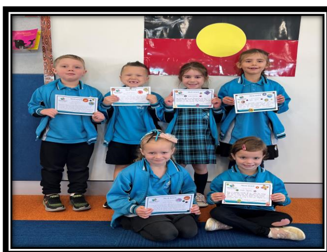
YEAR 1 MERIT AWARDS