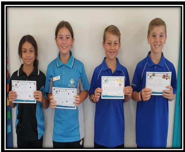
YEAR 6 MERIT AWARD