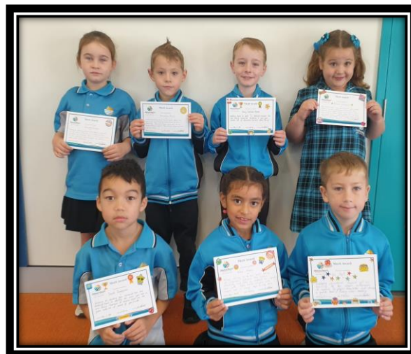
YEAR 1 MERIT AWARD