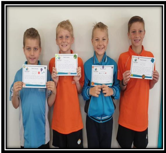
YEAR 4 MERIT AWARD