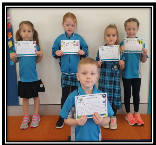
PRE-PRIMARY MERIT AWARD