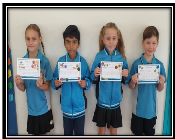
YEAR 2 MERIT AWARD