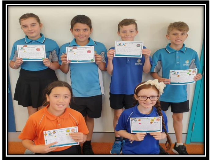
YEAR 5 MERIT AWARD