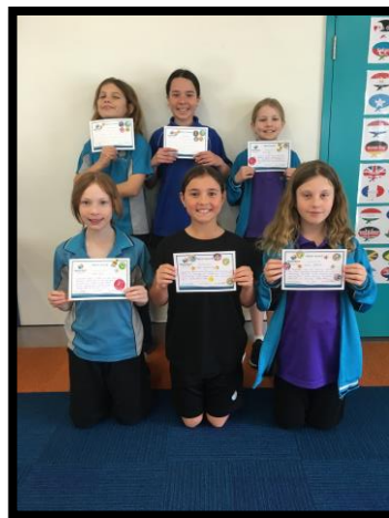
YEAR 5 MERIT AWARD