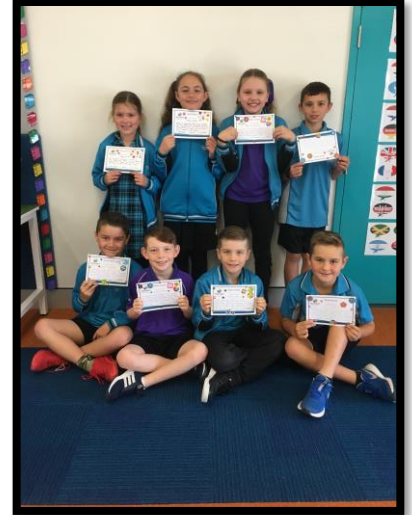
YR 3 MERIT AWARD