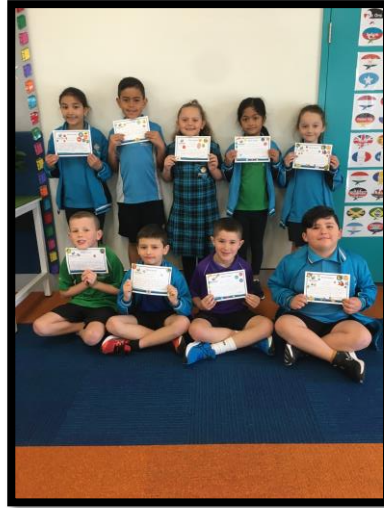
YR 2 MERIT AWARD