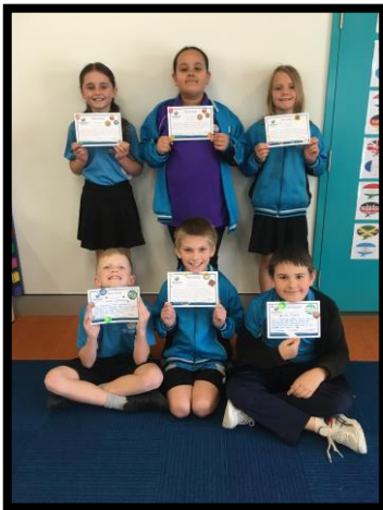
YEAR 4 MERIT AWARD