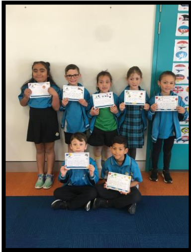
YR 1 MERIT AWARD