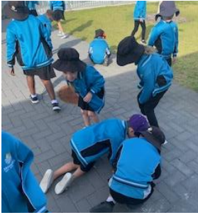
I found one!